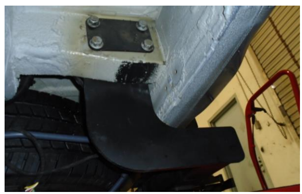
Figure 2: Four (4) of the Hitch Mounting Bolts

CAUTION: Unbolting the hitch will allow it to fall if not properly supported.