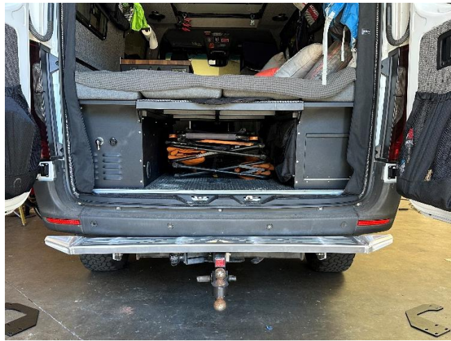
Figure 3: Hitch Clearance with Rear Nerf Step Installed